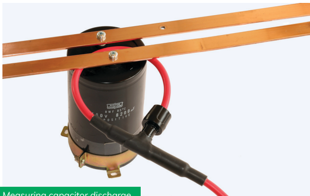
Measuring capacitor discharge

The CWTLF is a flexible, clip-around Rogowski probe with an extended low frequency bandwidth. This makes it ideal for power frequency and harmonic current analysis, measuring long duration pulses, or measuring large magnitude fault currents with frequency components of just a few Hz.