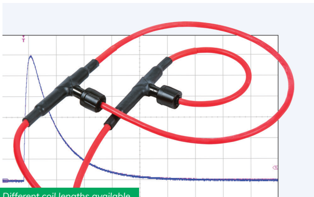
Different coil lengths available